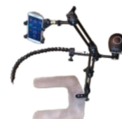
Bed Switch Mount