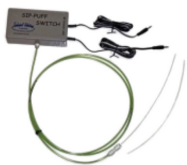
Sip n Puff Switch

Please Note: Side Grip Handles, Bed Rails and Mattress Support Bars cannot be used in conjunction with Upholstered Bed Frame Side Panels.