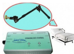
Scanning Bed Controller