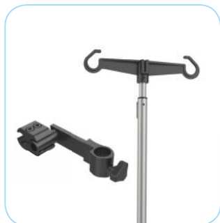
Infusion standard with holder