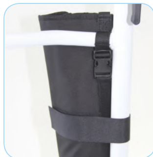
Oxygen bottle holder

Platform is CE-marked and fulfils the requirements of EU directive 93/42 EEC for medical devices.