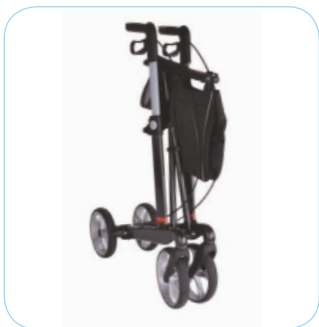
Athlon SL is easy to fold and stays folded with an easy-to-use locking system.