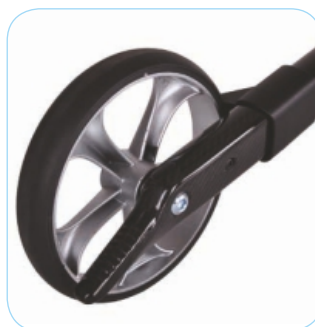
Maintenance free brakes and TPE-covered unbreakable wheels.