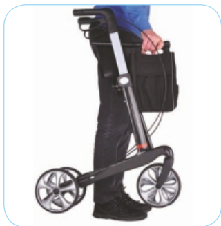
Ergonomically designed handle grips make Athlon SL easy to transport, if needed.