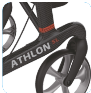
Unique triangle carbon fibre profile ensures the durability up to 150 kg.