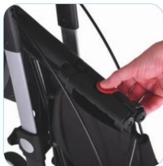
Stays firmly closed with the lock and is easy to open with the push button.