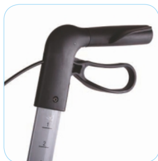
Smooth adjustable handle height and lockable handbrakes.

Athlon SL push handles height adjustable to 10 positions, from 63 cm to 102 cm. User comfort is ensured with three different seat heights - 62, 55 and 50 cm - as well as optimal frame design and ergonomic push handles.