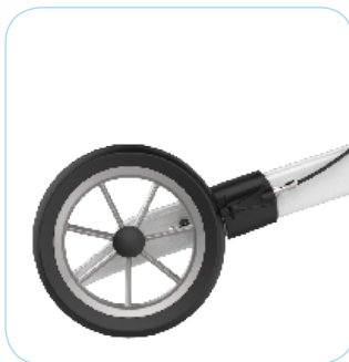
All sizes can be fitted with soft comfort wheels.